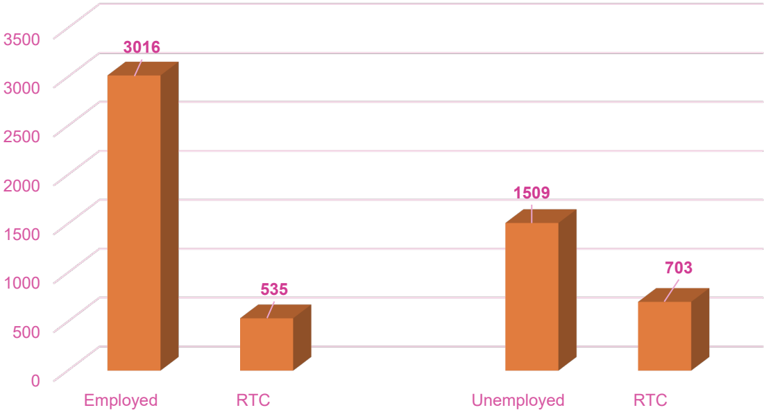
Employed versus Unemployed